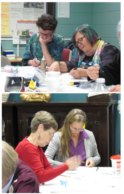
4<sup>th</sup> quarter meeting in Joliet: Saturday gathering with the Joliet Women

I must admit that I came close to having my first panic attack when, after six years on the Council, I was required to take a year off. As usual, life finds a way to fill in the open spots, and I've survived. The Spring Conferences and Fall Retreats have been the emotional foods that sustain me. Whether attending all the activities and workshops or just taking out personal time, just being in the company of these wonderful UU women has been uplifting. I'm not really surprised that at each of these two yearly events, I meet ladies that I have more in common with than I knew and so look forward to deepening those relationships as well as those previously formed. Connecting with the elements has also come to be very meaningful for me. Whether we connect with the element highlighted in the gathering or find another of the Earth, Air, Fire, Water or Spirit elements that calls to us, we are learning to embrace that and flow with the