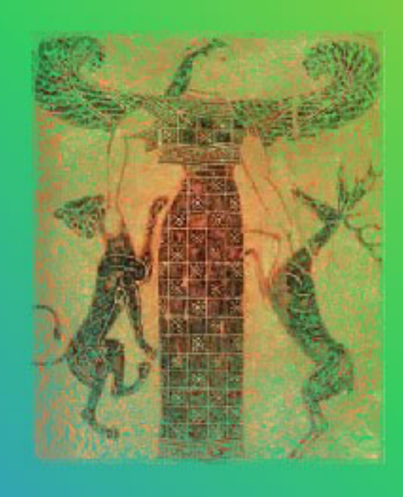
Retreat Organized by Spirals in Motion

Aurora University, George Williams College Campus on Lake Geneva, WI