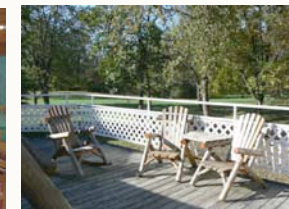
Labrynth, pond, and porches are just a few outdoor temptations.