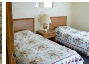
Comfy beds and private bathrooms make for good rest.