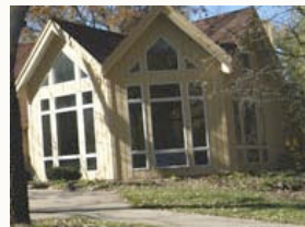
Express yourself in worship using your own unique style.

Indulge in spiritual practices old and new. Expect drumming and dancing around a roaring campfire with chanting sprinkled in as we go. Explore "toe reading" and other energy work with our keynote speaker Teri Freesmeyer. Listen to your sister's tell stories from their own life path and share your own. Take your own silent pilgrimage wandering the grounds alone.