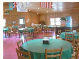
Enjoy meals together prepared for you with NO Dishes afterward!

Lots of learning will also be offered to stimulate your mind. Explore your potential through color analysis where you can learn to choose the very best clothes, jewelry, makeup and even hair color for yourself. Discuss ways to simplify your life through organization and priority setting. Find out about natural methods for routine health practice.