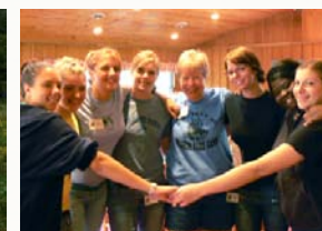
Make new friendships and bond with women you already know.