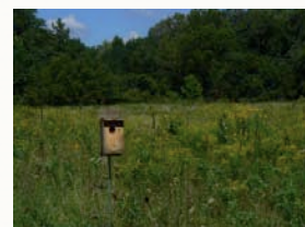
Walking trails, stream, hilltop view inspire peace within.

Several workshops are designed specifically for your physical needs. Included in this array are massage, manicure, pedicure, creating bath soaps and salts, adornment crafting to beautify your body -goddess gowns, jewelry and beading for hands, feet, head and even an instant face lift. Enjoy a sensual atmosphere with the sights, sounds, and smells of a relaxing, rejuvenating experience.