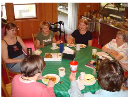
2008 Spring Retreat at Pilgrim Park: Breakfast circle. Planners: Joliet, Illinois UU Women